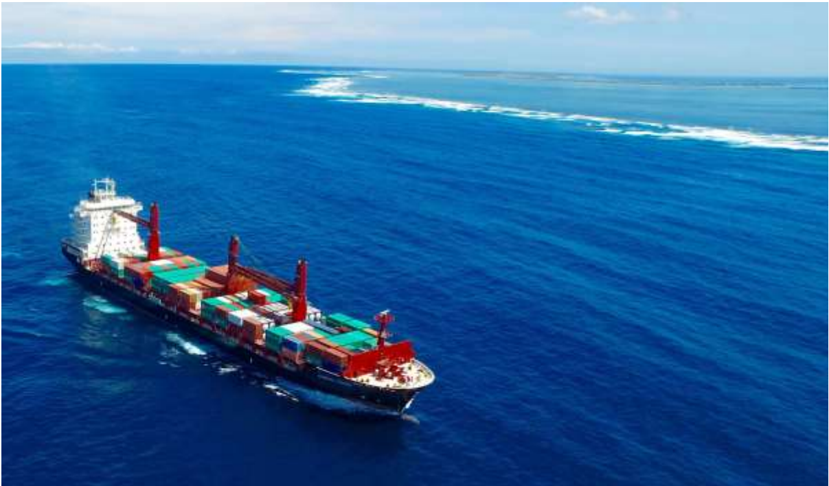
MV Coral Chief, is one of the CNCo's vessels servicing the Pacific islands.